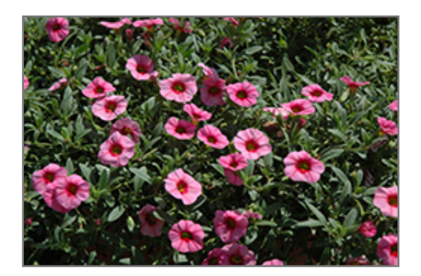
MiniFamous Dark Pink Eye Calibrachoa flowers