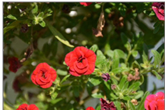
MiniFamous Double Compact Red Calibrachoa flowers