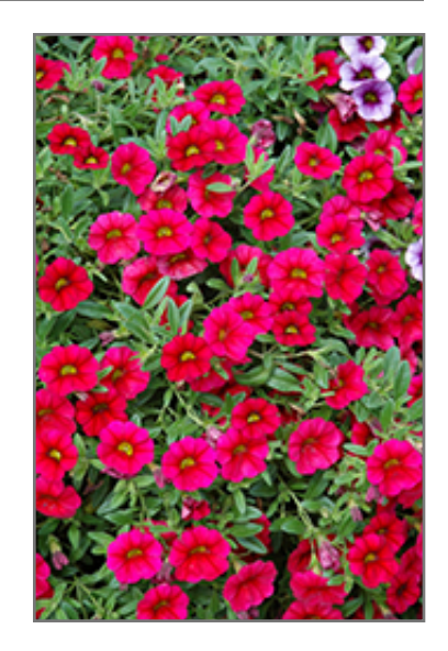
MiniFamous Neo Cherry Red Calibrachoa flowers