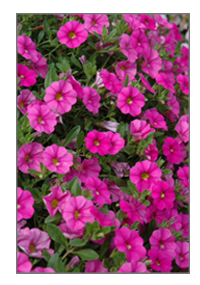
MiniFamous Neo Pink Calibrachoa flowers