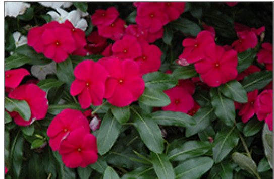
Valiant Burgundy Vinca flowers

Valiant Burgundy Vinca is recommended for the following landscape applications;