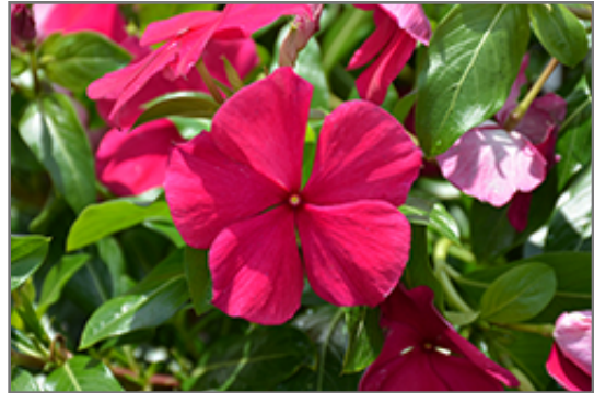
Valiant Burgundy Vinca flowers

Valiant Burgundy Vinca will grow to be about 12 inches tall at maturity, with a spread of 18 inches. Its foliage tends to remain dense right to the ground, not requiring facer plants in front. Although it's not a true annual, this fast-growing plant can be expected to behave as an annual in our climate if left outdoors over the winter, usually needing replacement the following year. As such, gardeners should take into consideration that it will perform differently than it would in its native habitat.