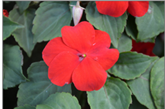
Lollipop Cherry Red Impatiens flowers