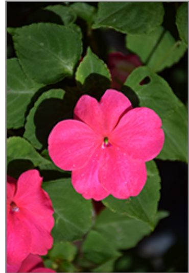
Lollipop Fruit Punch Rose Impatiens flowers