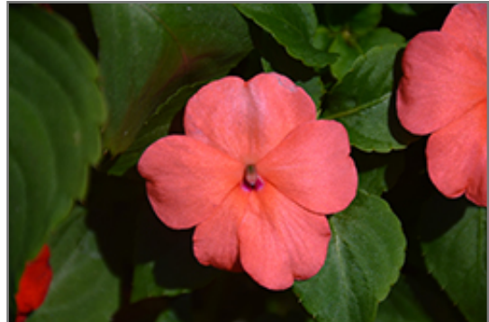
Lollipop Peach Salmon Impatiens flowers