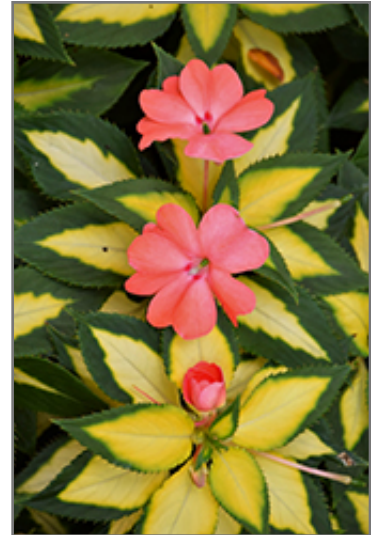
SunPatiens Spreading Salmon New Guinea Impatiens flowers

SunPatiens Spreading Salmon New Guinea Impatiens is recommended for the following landscape applications;