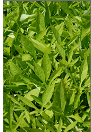
SolarPower Lime Sweet Potato Vine foliage

SolarPower Lime Sweet Potato Vine will grow to be about 12 inches tall at maturity, with a spread of 3 feet. Its foliage tends to remain dense right to the ground, not requiring facer plants in front. This fast-growing annual will normally live for one full growing season, needing replacement the following year.