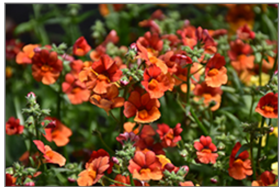
Sunsatia Blood Orange Nemesia flowers