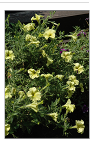
Happy Classic Marble Yellow Petunia flowers

Happy Classic Marble Yellow Petunia will grow to be about 12 inches tall at maturity, with a spread of 18 inches. When grown in masses or used as a bedding plant, individual plants should be spaced approximately 15 inches apart. Its foliage tends to remain dense right to the ground, not requiring facer plants in front. This fast-growing annual will normally live for one full growing season, needing replacement the following year.