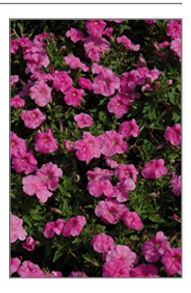
Mambo GP Sweet Pink Petunia flowers

Mambo GP Sweet Pink Petunia will grow to be about 8 inches tall at maturity, with a spread of 12 inches. When grown in masses or used as a bedding plant, individual plants should be spaced approximately 10 inches apart. Its foliage tends to remain low and dense right to the ground. This fast-growing annual will normally live for one full growing season, needing replacement the following year.