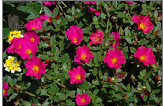
Mojave Fuchsia Portulaca flowers