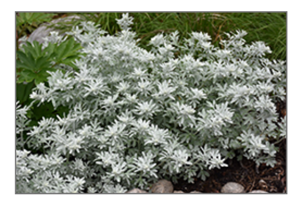
Silver Brocade Artemisia