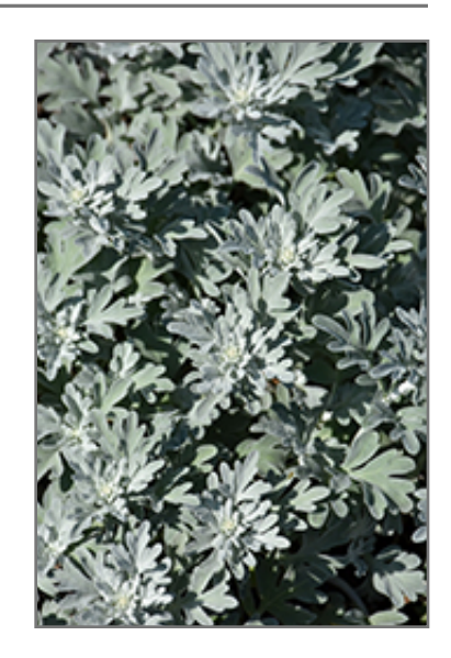
Silver Brocade Artemisia foliage