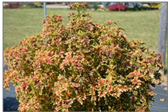
Under The Sea Copper Coral Coleus