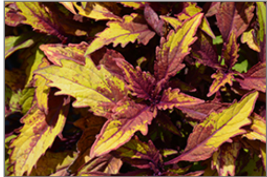
FlameThrower Spiced Curry Coleus foliage