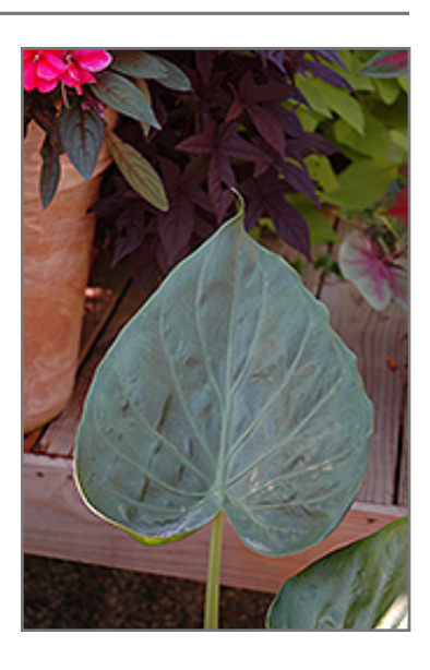
Hooded Dwarf Elephant's Ear foliage

When grown indoors, Hooded Dwarf Elephant's Ear can be expected to grow to be about 3 feet tall at maturity, with a spread of 3 feet. It grows at a medium rate, and under ideal conditions can be expected to live for approximately 5 years. This houseplant should be situated in a location that that gets indirect sunlight at most, although it will usually require a more brightly-lit environment than what artificial indoor lighting alone can provide. It is quite adaptable, prefering to grow in average to wet conditions, and will even tolerate some standing water. The surface of the soil should be kept consistently moist all of the time, and you should expect to water this plant two or more times each week, especially if it's growing in a low-humidity environment. Be aware that your particular watering schedule may vary depending on its location in the room, the pot size, plant size and other conditions; if in doubt, ask one of our experts in the store for advice. It is not particular as to soil type or pH; an average potting soil should work just fine. Be warned that parts of this plant are known to be toxic to humans and animals, so special care should be exercised if growing it around children and pets.