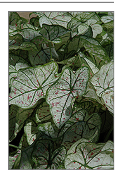
Candidum Jr. Caladium foliage

There are many factors that will affect the ultimate height, spread and overall performance of a plant when grown indoors; among them, the size of the pot it's growing in, the amount of light it receives, watering frequency, the pruning regimen and repotting schedule. Use the information described here as a guideline only; individual performance can and will vary. Please contact the store to speak with one of our experts if you are interested in further details concerning recommendations on pot size, watering, pruning, repotting, etc.