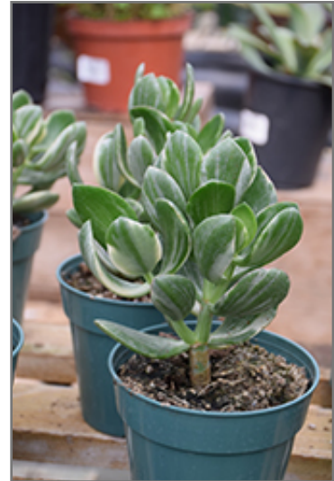
Variegated Jade Plant in full

When grown indoors, Variegated Jade Plant can be expected to grow to be about 4 feet tall at maturity, with a spread of 4 feet. It grows at a slow rate, and under ideal conditions can be expected to live for approximately 15 years. This houseplant will do well in a location that gets either direct or indirect sunlight, although it will usually require a more brightly-lit environment than what artificial indoor lighting alone can provide. It prefers dry to average moisture levels with very well-drained soil, and may die if left in standing water for any length of time. This plant should be watered when the surface of the soil gets dry, and will need watering approximately once each week. Be aware that your particular watering schedule may vary depending on its location in the room, the pot size, plant size and other conditions; if in doubt, ask one of our experts in the store for advice. It is not particular as to soil pH, but grows best in sandy soil. Contact the store for specific recommendations on pre-mixed potting soil for this plant. Be warned that parts of this plant are known to be toxic to humans and animals, so special care should be exercised if growing it around children and pets.