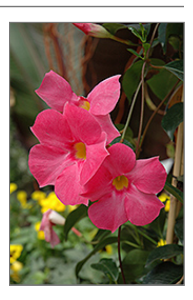
Sun Parasol Pretty Pink Mandevilla flowers

There are many factors that will affect the ultimate height, spread and overall performance of a plant when grown indoors; among them, the size of the pot it's growing in, the amount of light it receives, watering frequency, the pruning regimen and repotting schedule. Use the information described here as a guideline only; individual performance can and will vary. Please contact the store to speak with one of our experts if you are interested in further details concerning recommendations on pot size, watering, pruning, repotting, etc.