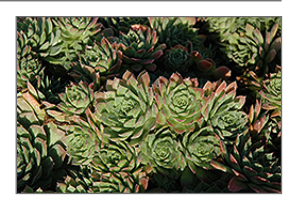
Carmen Hens And Chicks foliage

When grown indoors, Carmen Hens And Chicks can be expected to grow to be only 3 inches tall at maturity extending to 8 inches tall with the flowers, with a spread of 12 inches. It grows at a medium rate, and under ideal conditions can be expected to live for approximately 20 years. This houseplant requires direct sun for optimal performance, and should therefore be situated in a room that gets bright sunlight for a good part of the day; it is not a good choice for rooms lit only by artificial light. It prefers dry to average moisture levels with very well-drained soil, and may die if left in standing water for any length of time. This plant should be watered when the surface of the soil gets dry, and will need watering approximately once each week. Be aware that your particular watering schedule may vary depending on its location in the room, the pot size, plant size and other conditions; if in doubt, ask one of our experts in the store for advice. It is not particular as to soil pH, but grows best in sandy soil. Contact the store for specific recommendations on pre-mixed potting soil for this plant.