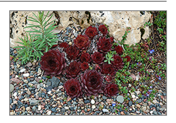
Sanford's Hybrid Hens And Chicks

When grown indoors, Sanford's Hybrid Hens And Chicks can be expected to grow to be only 4 inches tall at maturity extending to 12 inches tall with the flowers, with a spread of 12 inches. It grows at a medium rate, and under ideal conditions can be expected to live for approximately 20 years. This houseplant requires direct sun for optimal performance, and should therefore be situated in a room that gets bright sunlight for a good part of the day; it is not a good choice for rooms lit only by artificial light. It prefers dry to average moisture levels with very well-drained soil, and may die if left in standing water for any length of time. This plant should be watered when the surface of the soil gets dry, and will need watering approximately once each week. Be aware that your particular watering schedule may vary depending on its location in the room, the pot size, plant size and other conditions; if in doubt, ask one of our experts in the store for advice. It is not particular as to soil pH, but grows best in sandy soil. Contact the store for specific recommendations on pre-mixed potting soil for this plant.