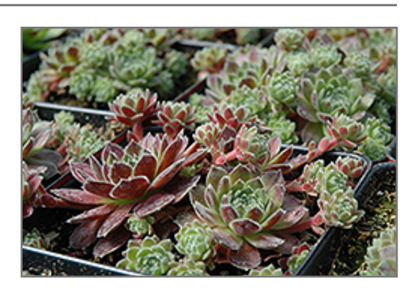
Sunkist Hens And Chicks foliage

When grown indoors, Sunkist Hens And Chicks can be expected to grow to be only 3 inches tall at maturity extending to 12 inches tall with the flowers, with a spread of 12 inches. It grows at a medium rate, and under ideal conditions can be expected to live for approximately 20 years. This houseplant requires direct sun for optimal performance, and should therefore be situated in a room that gets bright sunlight for a good part of the day; it is not a good choice for rooms lit only by artificial light. It prefers dry to average moisture levels with very well-drained soil, and may die if left in standing water for any length of time. This plant should be watered when the surface of the soil gets dry, and will need watering approximately once each week. Be aware that your particular watering schedule may vary depending on its location in the room, the pot size, plant size and other conditions; if in doubt, ask one of our experts in the store for advice. It is not particular as to soil pH, but grows best in sandy soil. Contact the store for specific recommendations on pre-mixed potting soil for this plant.