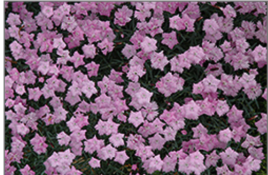
Bath's Pink Pinks in bloom