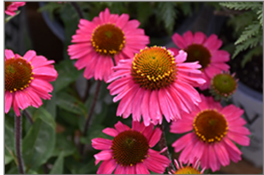
Sensation Pink Coneflower flowers