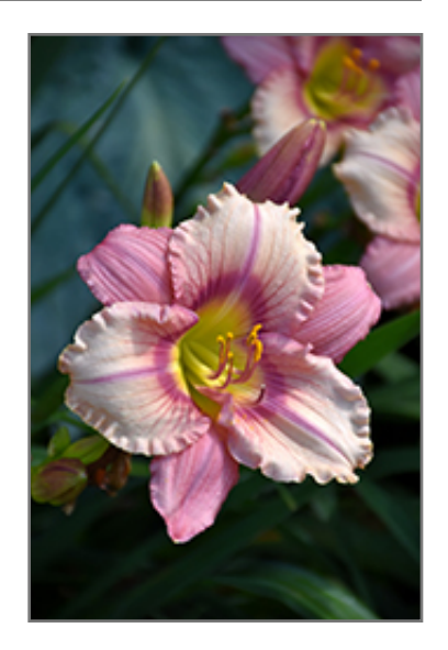
Happy Ever Appster Stephanie Returns Daylily flowers