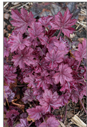
Wild Rose Coral Bells foliage