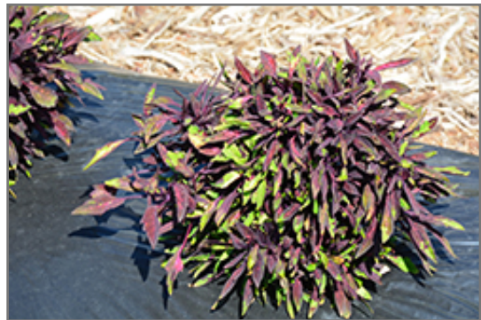
Fancy Feathers Black Coleus