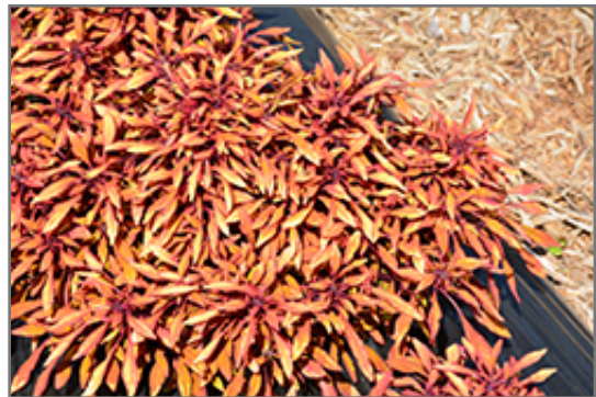
Fancy Feathers Copper Coleus