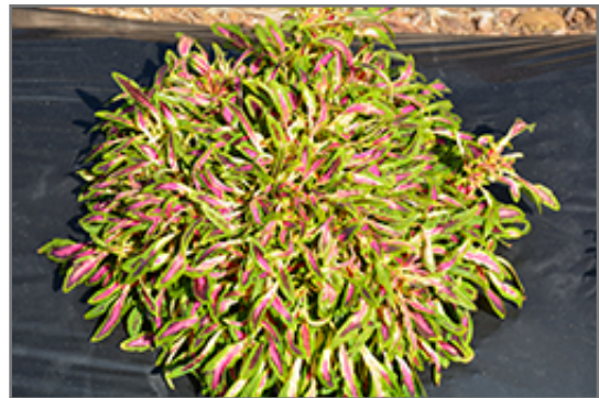
Fancy Feathers Pink Coleus