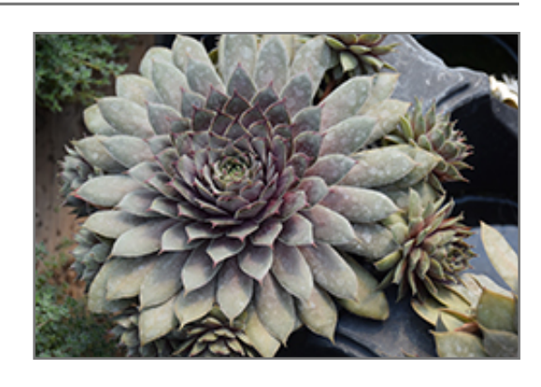
Twilight Blues Hens And Chicks

When grown indoors, Twilight Blues Hens And Chicks can be expected to grow to be only 3 inches tall at maturity extending to 8 inches tall with the flowers, with a spread of 8 inches. It grows at a medium rate, and under ideal conditions can be expected to live for approximately 20 years. This houseplant requires direct sun for optimal performance, and should therefore be situated in a room that gets bright sunlight for a good part of the day; it is not a good choice for rooms lit only by artificial light. It prefers dry to average moisture levels with very well-drained soil, and may die if left in standing water for any length of time. This plant should be watered when the surface of the soil gets dry, and will need watering approximately once each week. Be aware that your particular watering schedule may vary depending on its location in the room, the pot size, plant size and other conditions; if in doubt, ask one of our experts in the store for advice. It is not particular as to soil pH, but grows best in sandy soil. Contact the store for specific recommendations on pre-mixed potting soil for this plant.