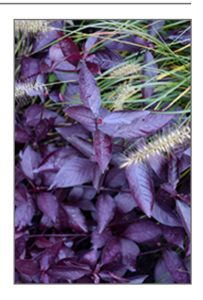
Rubiginosa Alternanthera foliage

There are many factors that will affect the ultimate height, spread and overall performance of a plant when grown indoors; among them, the size of the pot it's growing in, the amount of light it receives, watering frequency, the pruning regimen and repotting schedule. Use the information described here as a guideline only; individual performance can and will vary. Please contact the store to speak with one of our experts if you are interested in further details concerning recommendations on pot size, watering, pruning, repotting, etc.