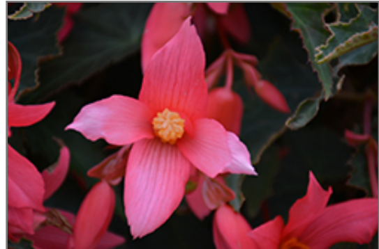
Bossa Nova Pink Glow Begonia flowers

Bossa Nova Pink Glow Begonia is recommended for the following landscape applications;