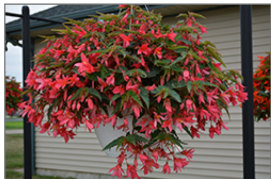
Bossa Nova Pink Glow Begonia in bloom