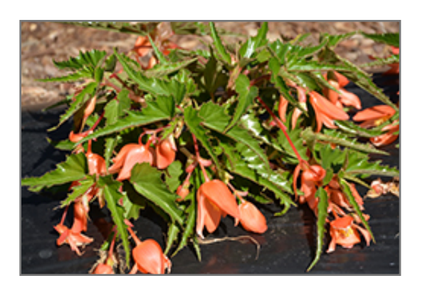
Summerwings Apricot Improved Begonia in bloom

17999 WCR 4 Brighton, CO, 80603 phone: 303-775-9629 www.incolorme.com