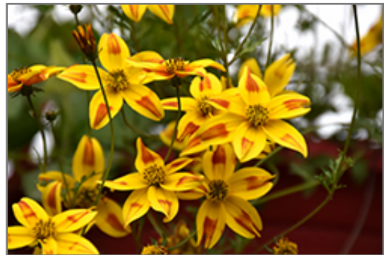
Beedance Red Stripe Bidens flowers