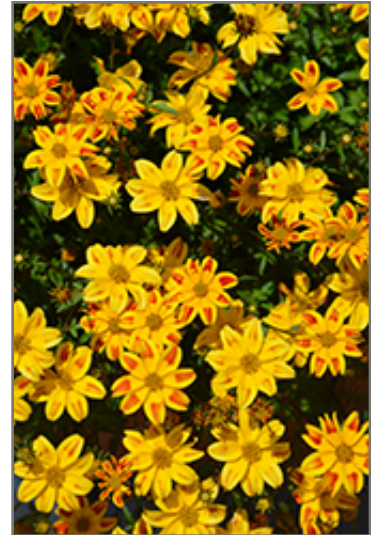
Beedance Red Stripe Bidens flowers