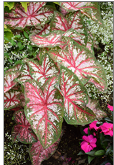
Artful Fire and Ice Caladium foliage