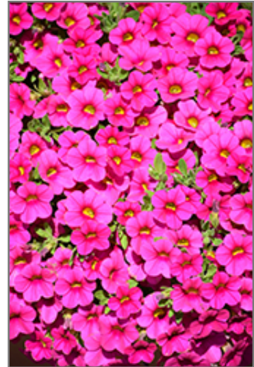
Million Bells Compact Brilliant Pink Calibrachoa flowers

Million Bells Compact Brilliant Pink Calibrachoa is recommended for the following landscape applications;