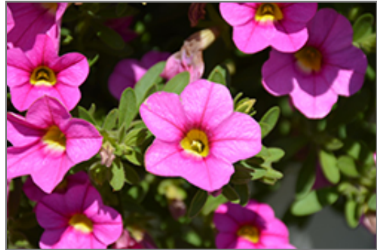
Million Bells Mounding Compact Pink Calibrachoa flowers

Million Bells Mounding Compact Pink Calibrachoa is recommended for the following landscape applications;