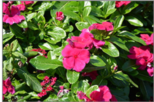
Cora Cascade Magenta Vinca flowers