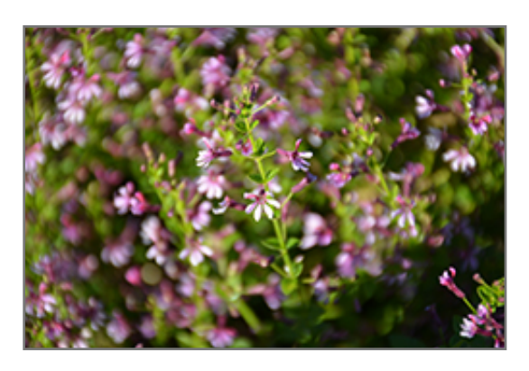
Fairy Dust Pink Cuphea flowers