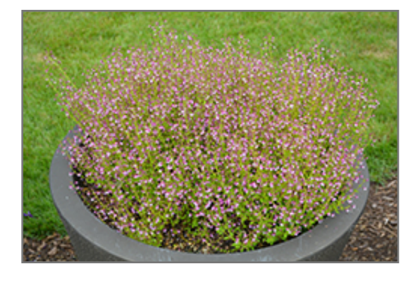
Fairy Dust Pink Cuphea in bloom