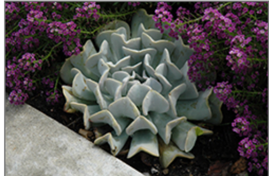
Topsy Turvy Echeveria

Topsy Turvy Echeveria is recommended for the following landscape applications;