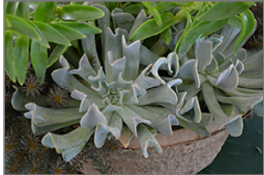
Topsy Turvy Echeveria

This is a dense herbaceous evergreen houseplant with tall flower stalks held atop a low mound of foliage. Its relatively fine texture sets it apart from other indoor plants with less refined foliage. This plant should not require much pruning, except when necessary to keep it looking its best.