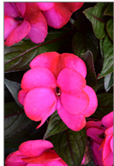
Infinity Blushing Lilac New Guinea Impatiens flowers