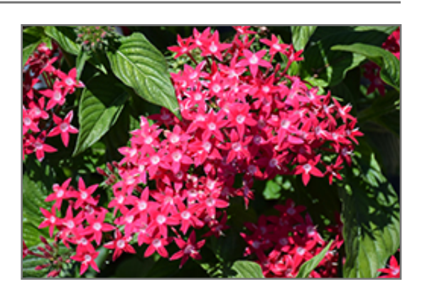
Butterfly Deep Rose Star Flower flowers