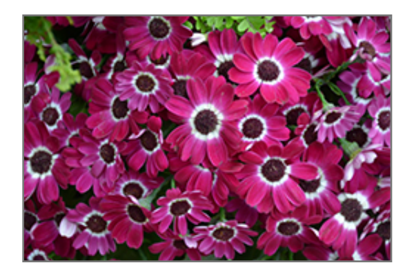
Senetti Baby Magenta Bicolor Pericallis flowers