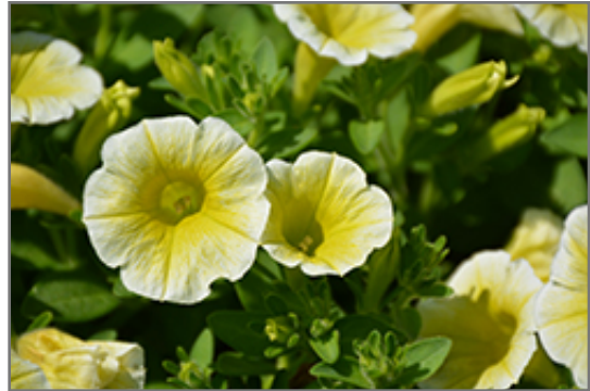
Blanket Yellow Petunia flowers