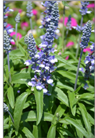
Cathedral Shining Sea Salvia flowers

Cathedral Shining Sea Salvia is recommended for the following landscape applications;