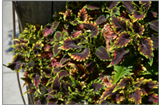
Sky Fire Coleus foliage