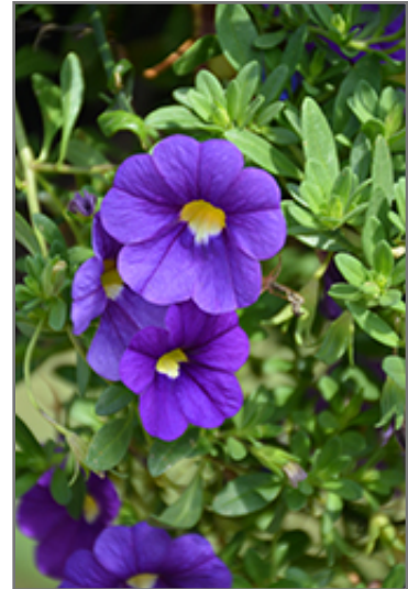
Catwalk Blue Jeans Calibrachoa flowers

Catwalk Blue Jeans Calibrachoa is recommended for the following landscape applications;